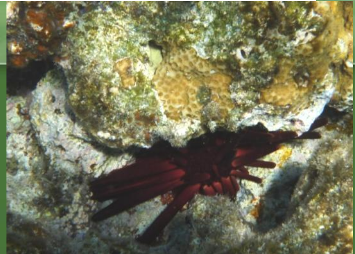
☐ Slate pencil urchin