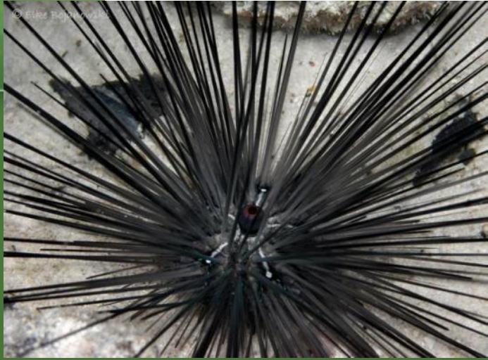
☐ Long-spined urchin