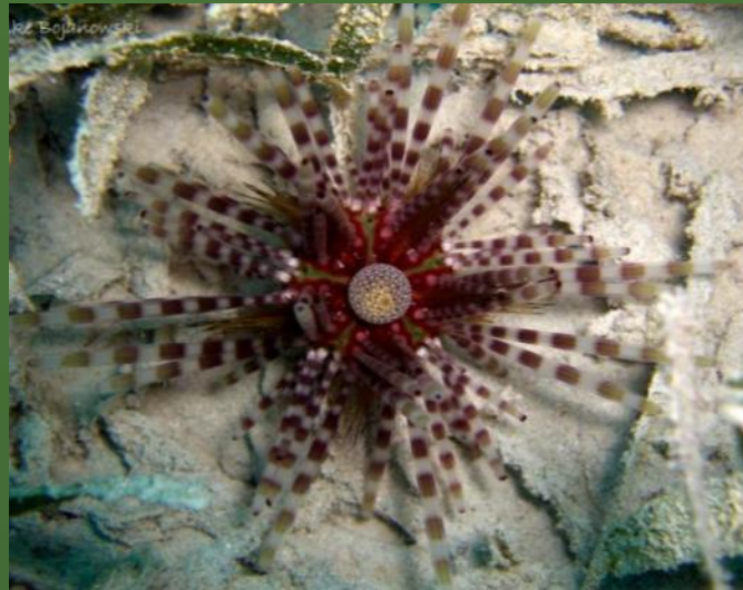
☐ Banded urchin